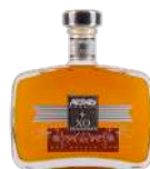
OUR "AMBASSADOR" CUVÉE

All stages of production are undertaken independently in view of adapting the various procedures to the vineyards' specific terroirs.